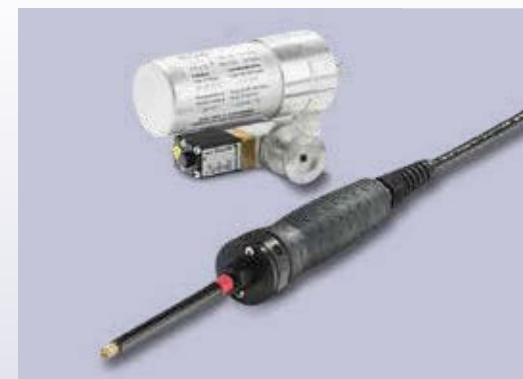
CALIBRATED STANDARD TEST LEAK TL7 AND SNIFFER LINE UP TO 10 M