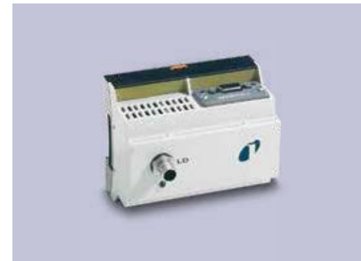
BM1000 BUS MODULE