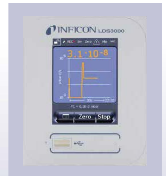
CU1000 OPTIONAL TOUCHSCREEN DISPLAY