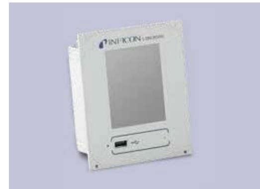
CU1000 CONTROL UNIT